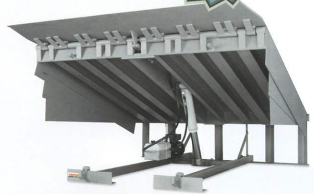
EH Series 7'x 8' 50,000 CIR with CleanSweep Frame shown.

The EH Leveler is powered by a heavy-duty 1.5 horsepower (TEFC) motor. The manifold incorporates a cartridge valve assembly that simplifies field adjustments and improves reliability. A translucent tank facilitates "at a glance" fluid level inspections.