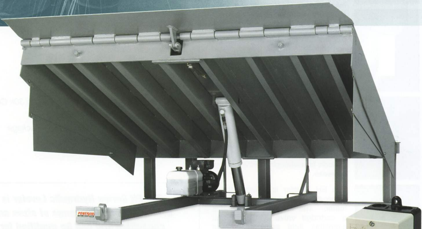
EH Series 7'x 8' 30,000 CIR with CleanSweep Frame shown.