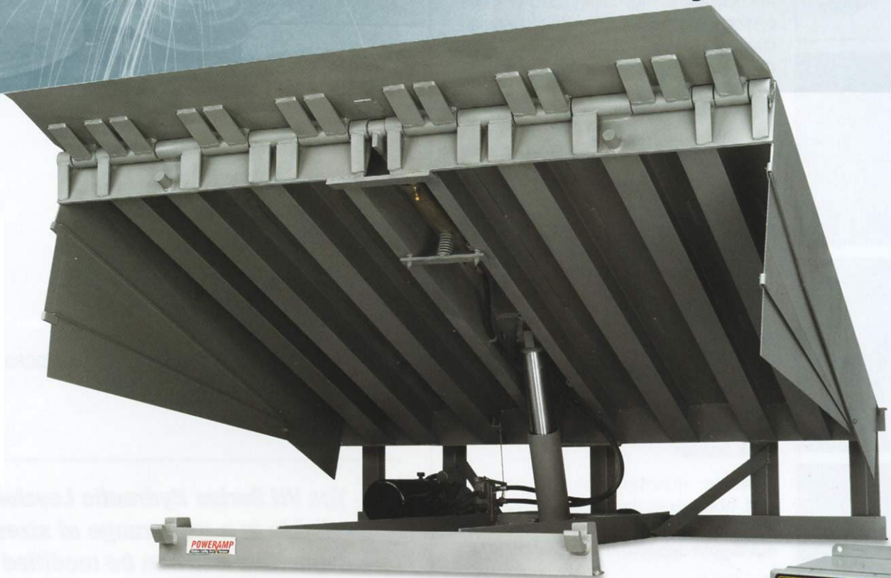
VH Series 7'x 8' 50,000 CIR with Conventional Frame shown.