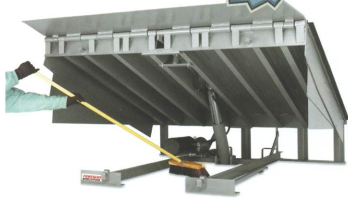
VH Series 7' x 8' 35,000 CIR with CleanSweep Frame™ shown.