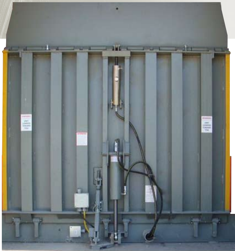
VS shown with remote motor and solenoids